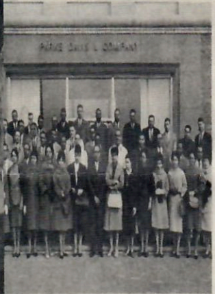
WILSON MEDICAL COLLEGE 1910 TO 1915